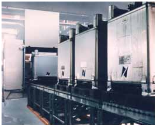
Left: NLB custom built turnkey system to wash totes inside and out.

Manual cleaning methods took 15-20 minutes per unit and required workers to physically enter the containers. The NLB automated tote cleaning system provides thorough and efficient cleaning in a fraction of the time of manual cleaning. Cleaning production improved from 55 containers per day with manual cleaning to over 110 per day with the NLB system.